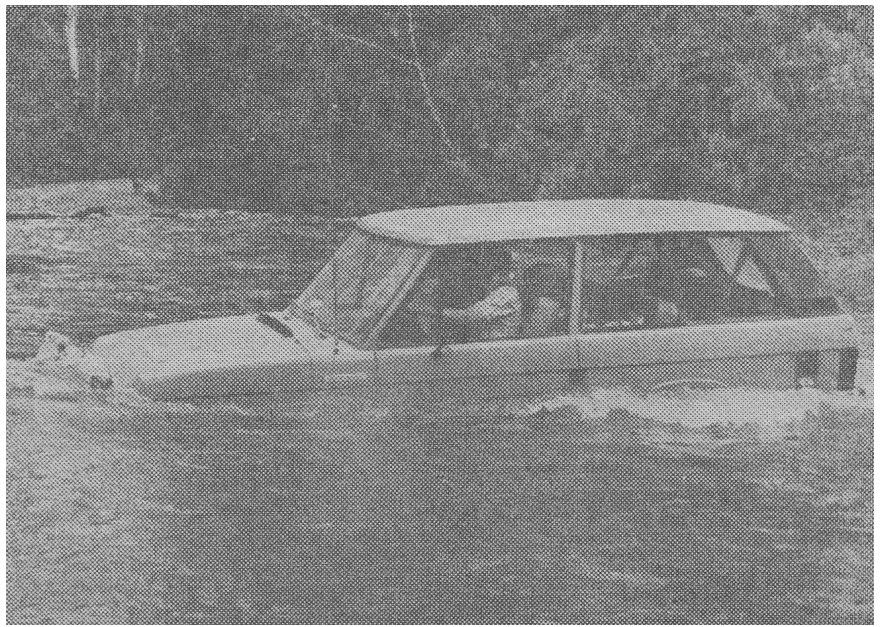
NO, it didn't stop. The "Toorak tractor" did it all in style, although it was towed through the last 5ft deep crossing on a winch cable.

His pride and joy though, is the six-wheel-drive