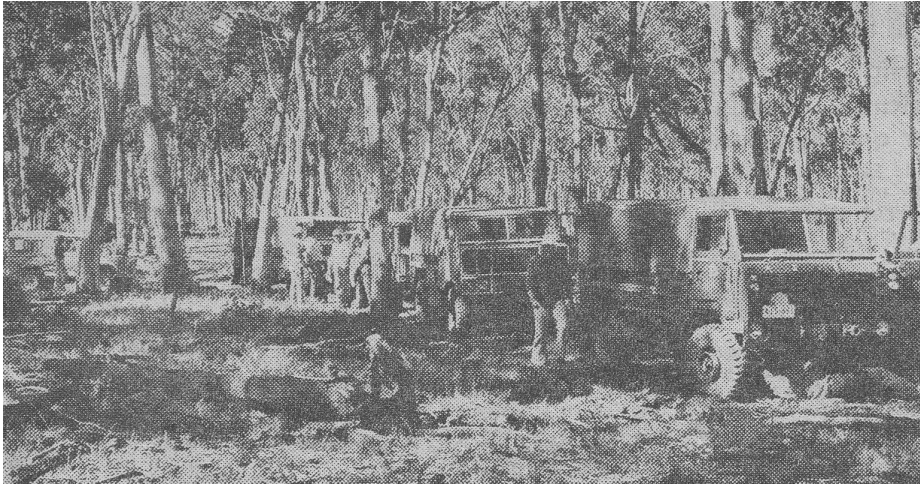
At rest in Butcher Country – a rare belt of timbered and lightly grassed sub-alpine woodland perched on a ridge between the Macalister and Caledonia Rivers.

We were on to the third last river crossing when the headlights went under and we lost sight of the far bank. The conversation died. It had been like that all day and by nightfall it didn't really matter if we stopped mid-steam or not. In eight hours we had covered a mere 12 km and had de-bogged ourselves and others so many times we could do it blindfolded. What started it all was a plan to take five Leyland vehicles on a three day trip through central Gippsland – from Licola up the Caledonia River to Butcher Country, then across the Snowy Plains and back via the Wonnangatta River and Dargo.