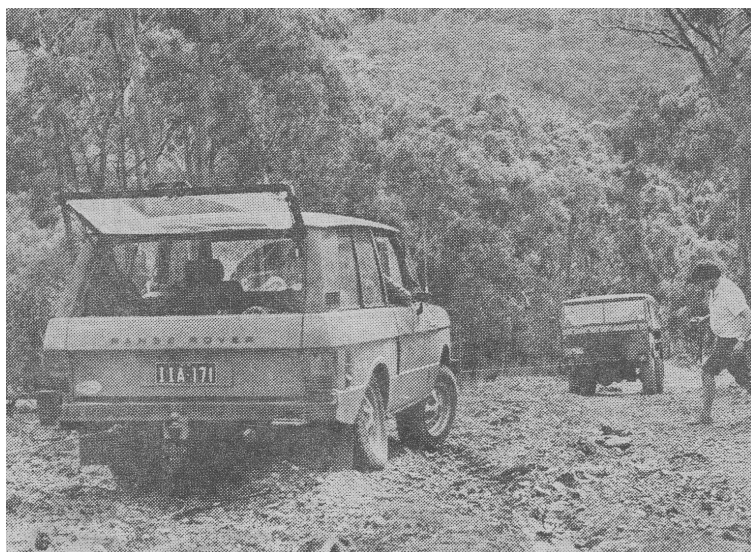
The automatic Range Rover excelled. Here it is winching a disabled "101" up the arduous Herne Spur out of the Wonnangatta.

One of the 101s gave us our only real problem for the three days. It blew a fuse on the second day and because of the complex electrical system – 24 volt with 12 volt start – the fault could not be traced without a factory manual. It had to be towed out by the truck-trailer and occasionally winched by the Range Rover.