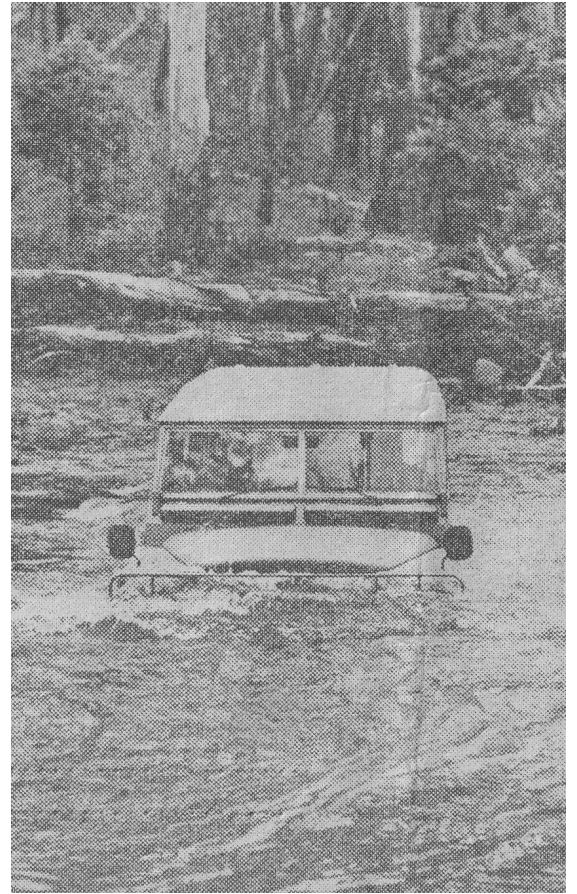
The turbocharged Land Rover could not be faulted. No lag or sudden surge, just plenty of power when needed.