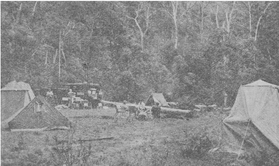
Camped on the Caledonia River. At first it looked like an army on manoeuvre. Dinner that night was marinated fillet steak with a choice of French or English mustard.

The area is crisscrossed with four-wheel-drive tracks and fire trails in various stages of dis-repair. Winter had been abnormally wet and the rivers were well up.