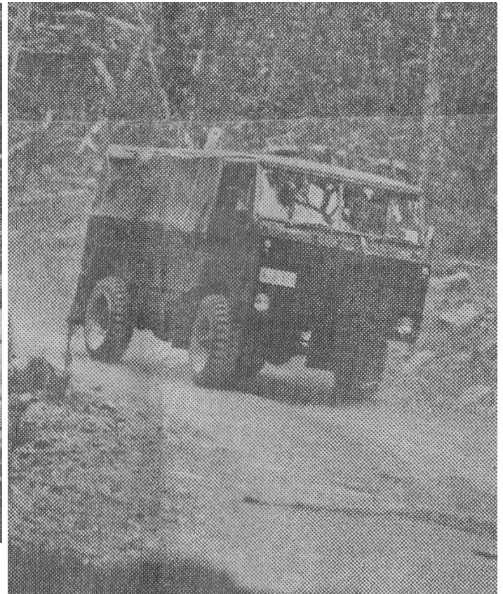
If the demand is there, these military type forward-control Land Rovers may be imported for around $21,000 each.

Land Rover trailer combination – built as a prototype by British Leyland for the Australian army and since discarded.