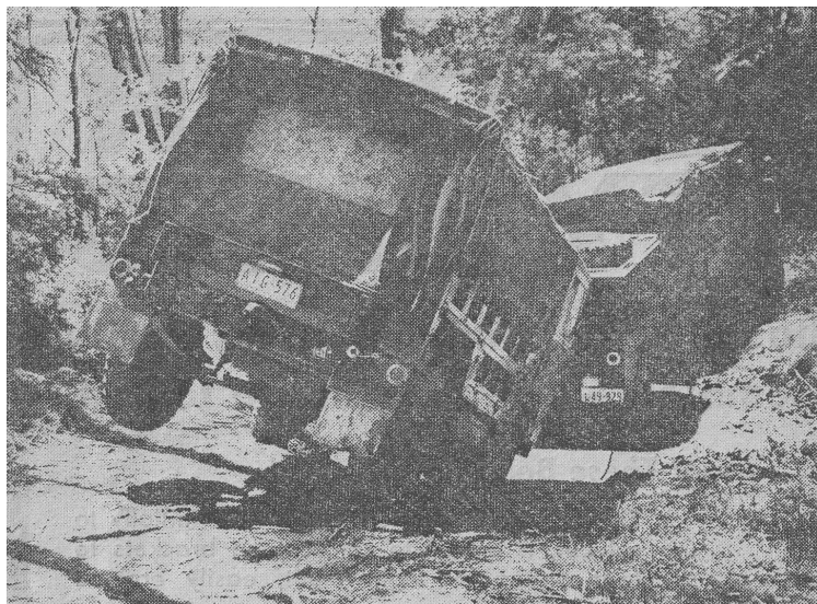
A "101" in a tricky spot on a solid tow behind the six-wheel-drive truck-trailer. It was only when the trailer lay on its side in the bog that the helpless driver in the 101 screamed.