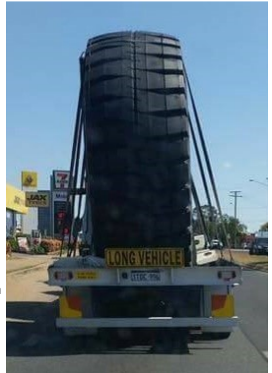
One of David Murray's new tyres arriving

Owners of Land Rovers in the UK with more than 9 seats must check their tyres' age ahead of new rules that come into force on 1 February 2021. Construction and Use Regulations are changing which will primarily affect coaches, heavy goods vehicles and bigger minibuses. But 10- and 12-seater Land Rovers will also fall under the new rules, which will not allow tyres aged over 10 years old to be used on single wheels fitted to a minibus (9-16 seats). LRO has checked with DVSA (Driver and Vehicle Standards Agency) who have confirmed that 10- and 12-seater Land Rovers do meet the definition of minibus. The new rules do not apply to vehicles over 40 years old which are used for non-commercial purposes, but 10+ seat long wheelbase (109-inch, One Ten and 110) station wagon models from late Series III through to 2007 – when the rules regarding forward-facing seats were introduced – could fall foul of the rules.