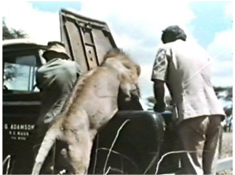
Now that's purring like a kitten