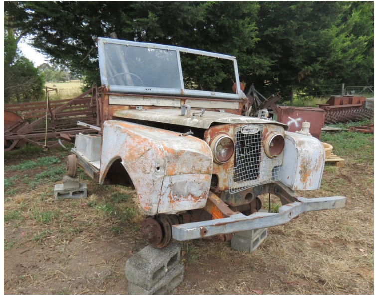
This Land Rover recently sold on an on-line-auction, it is a 1955 86" Series 1, It was located at Ripplebrook. It made $2,350