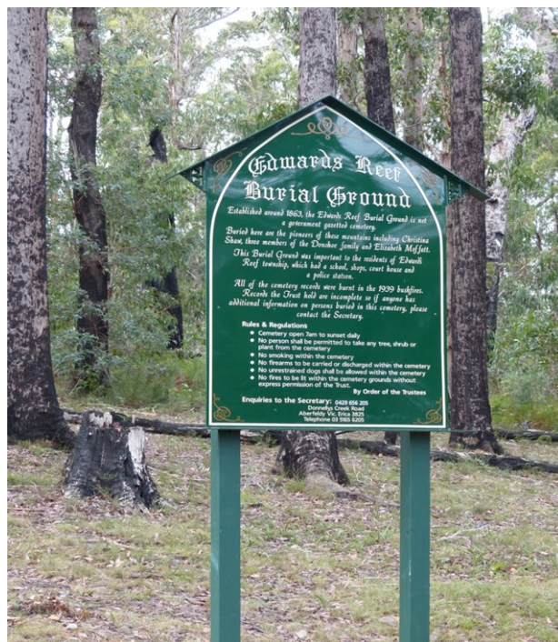
New Signage at Edwards Reef Burial Ground