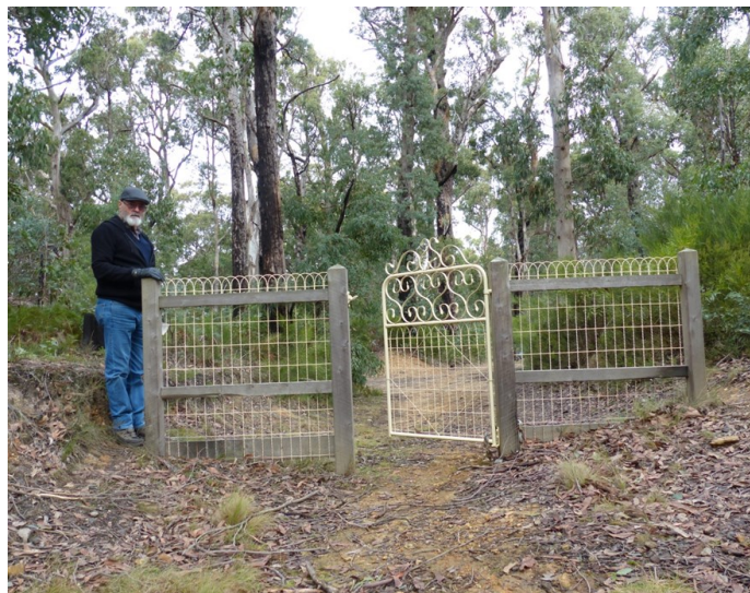
Entrance to the Edwards Reef Burial Ground