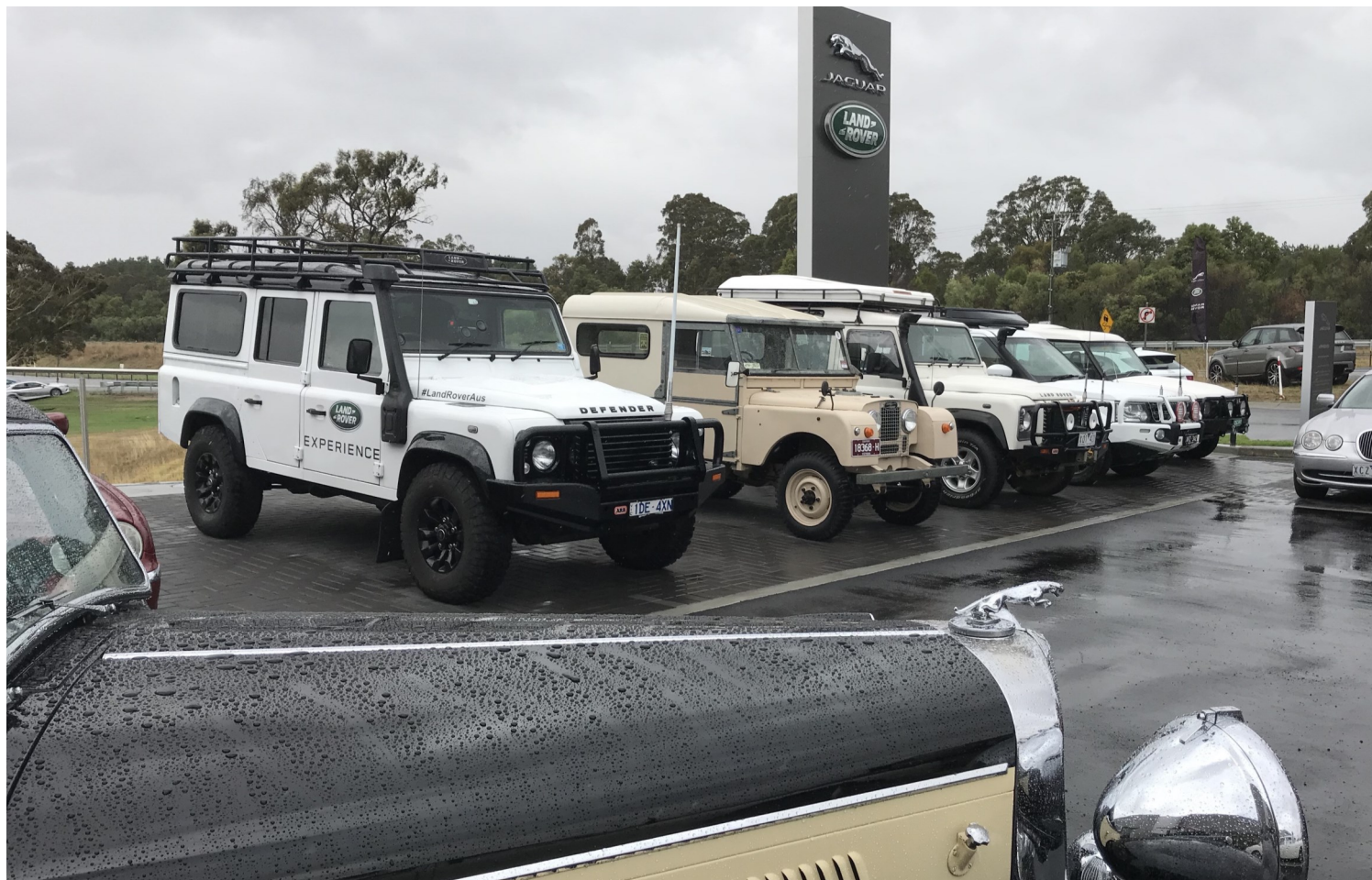
A view across the front of a Jaguar, of the Land Rover's on display at the official opening of Gippsland Land Rover in Traralgon on Saturday February the 9 th