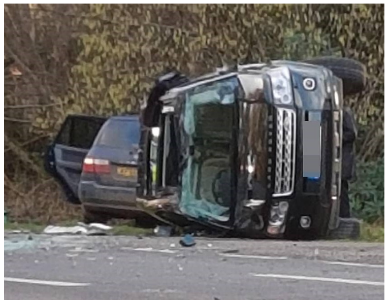
For Sale ; Land Rover Freelander 2 for wrecking, most mechanical parts, but only a few body parts available, Contact Phillip or Liz, at Buckingham Place