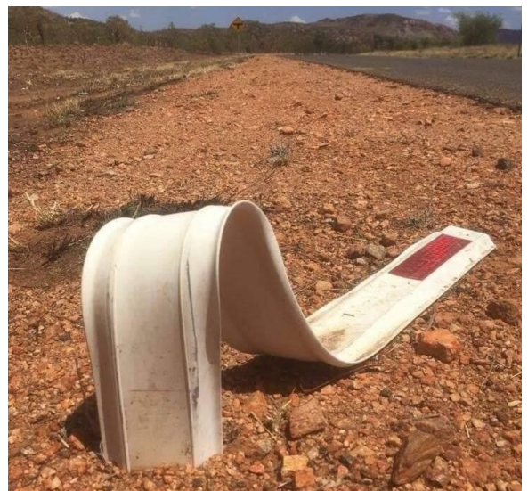
It's certainly been hot lately