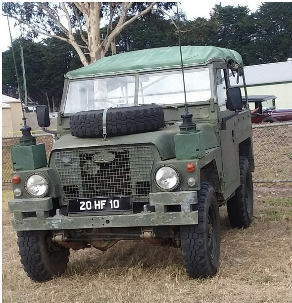
A rare Half Ton Land Rover seen at the Geelong Classic Truck & Machinery Show