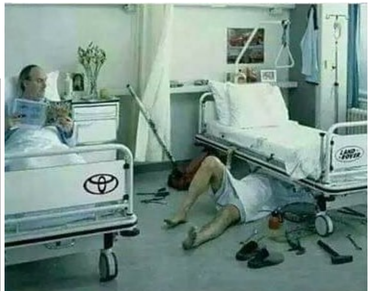
A Land Rover and Toyota owner side by side in hospital.....