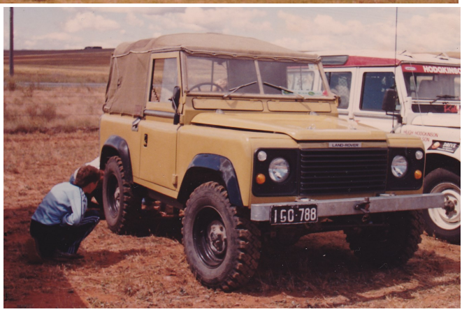
Plenty of interest was shown in Don Incoll's home made "90" at Cooma in 1988