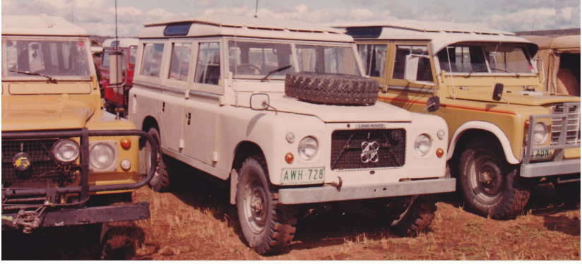
Seen at Cooma in 1988 was this Series 3 Stage 1 fitted with a 6-247 Perkins engine. This vehicle was converted in Australia by Jaguar Rover Australia, and was evaluated against an Isuzu 4BD1 powered Stage 1 to find a diesel engine to replace the 2.25 diesel engine for the Australian market, History shows the Isuzu won.