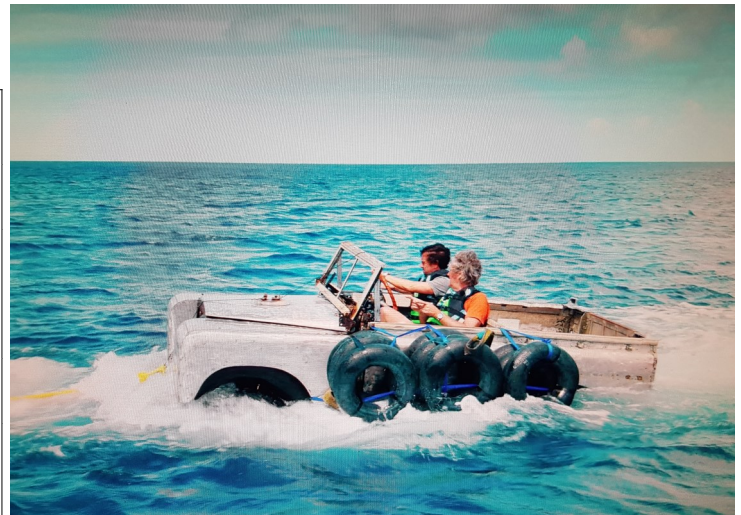
Boating at its best